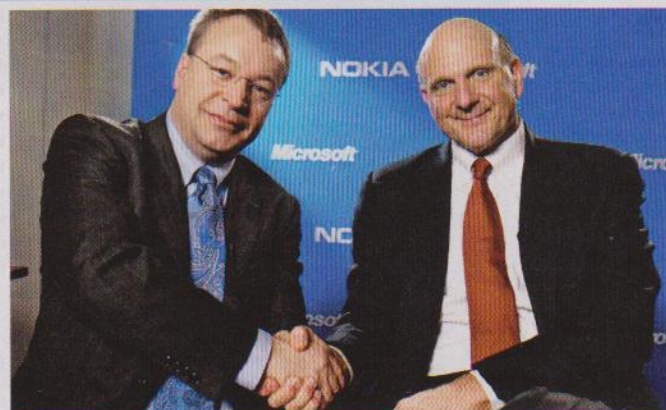
Smarter phones? Nokia's Stephen Elop and Microsoft's Steve Ballmer

LBO firms move into steadier, less profitable businesses p50 The IRS grills taxpayers on offshore accounts p52 Finding exotic jobs for unfulfilled bankers p53 Bid & Ask: The week's deals p54